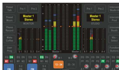
Sample Radio Screens